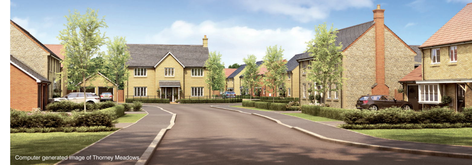
Computer generated image of Thorney Meadows.

For those wishing to commute further afield, Thorney is within easy reach of the A1 main north-south route and sits on the A47 which links Leicester and Norwich.