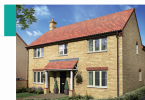
Oaklawn (3) Plot numbers: 38, 49, 71.