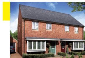
Windsor (16) Plot numbers: 1, 2, 16, 17, 18, 19, 34, 35, 67, 68, 72, 73, 74, 75, 79, 80.