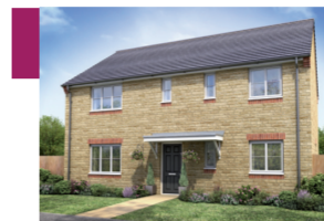
Musselburgh (7) Plot numbers: 7, 53, 59, 61, 63, 70, 77.