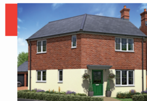
Newbury (2) Plot numbers: 28, 29.