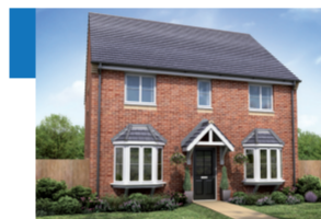
Redcar (5) Plot numbers: 8, 37, 51, 54, 60.