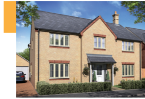
Bath (4) Plot numbers: 36, 50, 57, 76.