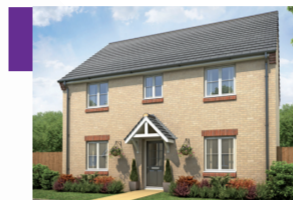
Galway (2) Plot numbers: 6, 62.