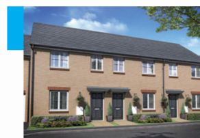
Newmarket (2) Plot numbers: 5, 65.