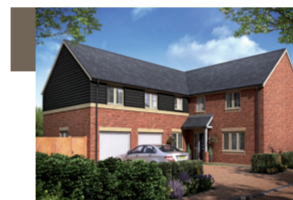
Thirsk (2) Plot numbers: 56, 58.

* Affordable housing plots: 11, 12, 20, 21, 22, 23, 24, 25, 26, 27, 30, 31, 32, 33, 39, 40, 41, 42, 43, 44, 45, 46, 47, 48.