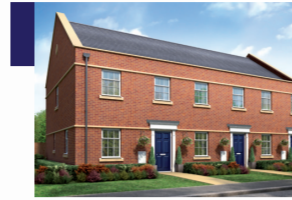
Chester (3) Plot numbers: 13, 14, 15.