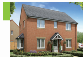
Nottingham (3) Plot numbers: 4, 10, 66.