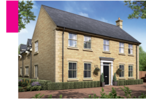
Cheltenham (5) Plot numbers: 3, 52, 55, 69, 78.