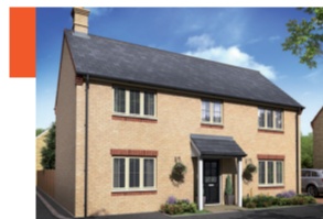
Sandown (1) Plot number: 64.