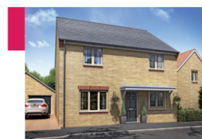
Ripon (1) Plot number: 9.